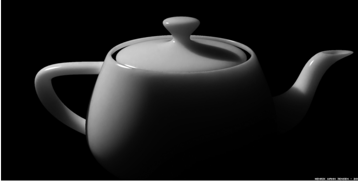
Fig. 1: Hendrik Wann Jensen, Utah Teapot rendered with BSSRDF, 2002.

oped in relation to different theoretical concepts of materiality. Before approaching the matter however, the stigma of immateriality still clinging to computer generated imagery, needs to be explored briefly.