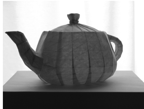
Fig. 5: Tomohiro Tachi, Origami Teapot (2006).

To sum up, a dissection of the teapot yields at least five material layers, from the making that leads to its encoding, to the material reality of the code itself, the CG object being in-material, the simulation of diverse material qualities and therefore being all-materials, and finally, its re-translation into the analogue. All these properties have fuelled the playful iconography of the teapot and show that the material