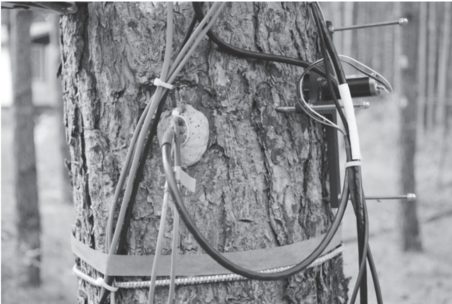
Fig. 2: Interface for data abstraction from the tweeting pine tree.