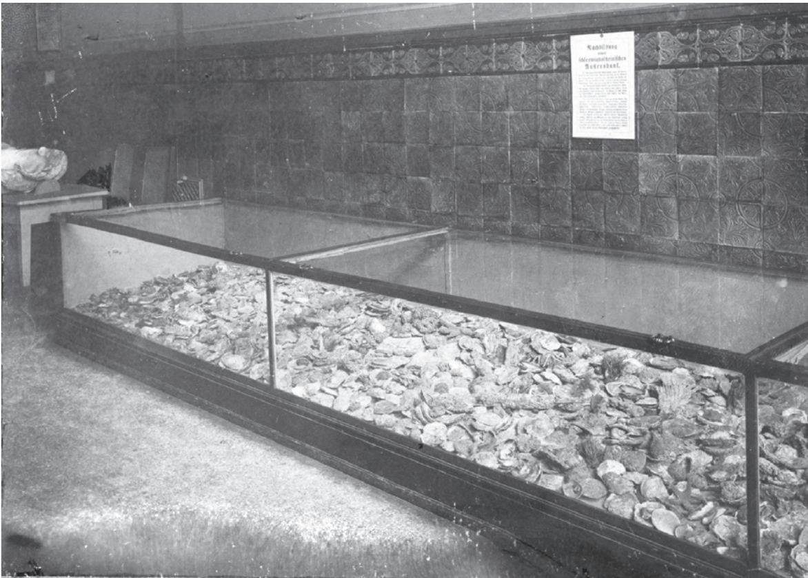
Fig. 7: Replica of an oyster bank from Schleswig-Holstein. Glass showcase from the collection of the Museum of Natural History Berlin showing the cohabitation of oysters and other maritime creatures in a biocenosis, Karl A. Möbius, late 19 th century.

What would it change if the encrusted cable in the glass case were to be moved into the collection of a Natural Museum? How would nature as media and media as nature be reconfigured if the glass case were to be placed next to the diorama of an oyster bank, which biologist, oyster-specialist, and director of the museum, Karl Möbius, installed in the late 19 th century—a habitat made of natural material he displayed at the Berlin Natural Museum to demonstrate how different specimen coexist in a biocenosis, or ecological community (Fig. 7)? Would this be an opportunity for contemplation about the politics of subjects and nature that we—people of the former colonies and industrialized countries—need to rethink