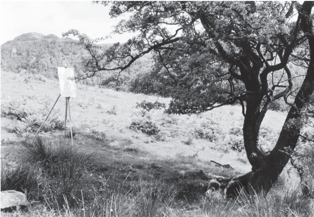
Fig. 4: Photography showing the arrangement for the Tim Knowles' artwork »Tree Drawing—Hawthorn on Easel #1«, Foot of Castel Crag, Borrowdale, Cumbria, 2005, in this case an oak tree with easel.

Of course, it is not so much the outcome but the arrangement that is interesting here. The role swap of the painter and the tree points to the idea of nature inscribing itself . By finding a simple and evident image for this pseudo self-inscription, Knowles refers to the dream of a direct inscription of nature. This concept of understanding nature by disclosing secret inscriptions from it is part of the scientific inscription of nature in data, but is also part of a common aesthetic of nature ( Naturästhetik ). This ideal also guided many representatives of nature writing who were writing about nature under the ideal of the greatest possible closeness to nature. But, as the example of the tweeting trees might represent, the aesthetic of nature today actually is dominated by media interfaces translating measurements into numbers and data. Nature is to be found in data. Therefore, it is essential to ask what nature is inscribed here. How are the interfaces arranged in order to make nature speak in data? And how are these processes still guided by the longing for a direct, immediate connection?