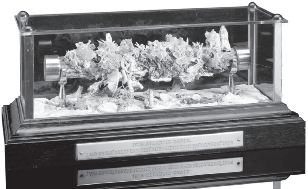
Fig. 6: Museum piece of a transatlantic cable covered with gutta percha from the Science Museum London, showing the biocenosis of organic and anorganic nature. The transatlantic cable is encrusted by inhabitants of the sea like corals and sea shells. The cable was installed in 1873; in 1906 parts of it were removed.

in Southeast Asia on islands like Papua, Malaysia and the Philippines, by that time under the rule of colonial powers.