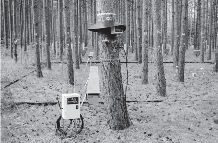
Fig. 1: Tweeting pine tree located in the forest-lab of the Thünen-Institute of forest ecology Brandenburg, Britz.