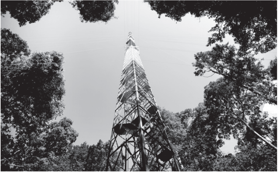
Fig. 5: Amazon Tall Tower Observatory monitoring the Amazon forest relationships between the jungle and the atmosphere since 2015 (Brazil's National Institute of Amazonian Research and Germany's Max Planck Institute.)