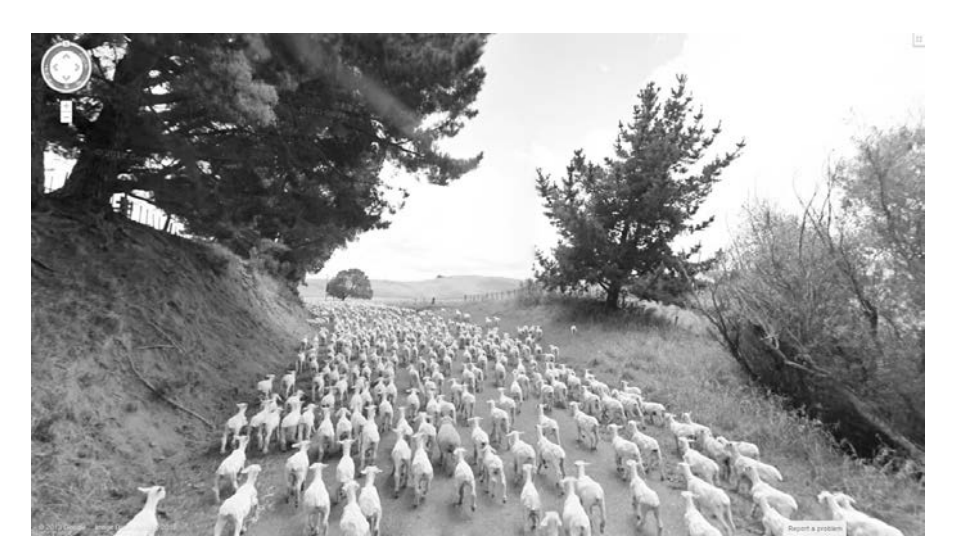
Fig. 4: Screenshot of a herd of sheep from Google Street View, 2010

Another thing that also occures on Google Street View are accidents, even if they are rare, or simply unseen or untold. One has been reported and acknowledged by the company on January 29<sup>th</sup>, 2009, leading an online testimonial untitled »Oh, deer: Street View and road safety reminders.«<sup>50</sup> This text brings back the part of banality of this huge archive project lead by the Silicon Valley player in which drivers are involved and face the same situations as local drivers. Sometimes a driver hits a deer, has to call the police, and follow common instructions for safety reasons. This collision reveals the embodied side of the process of recording. In that testimonial, the driver remains anonymous, Google Street View drivers are one of these ghostly figures of optical machine and enginery, and it is pretty