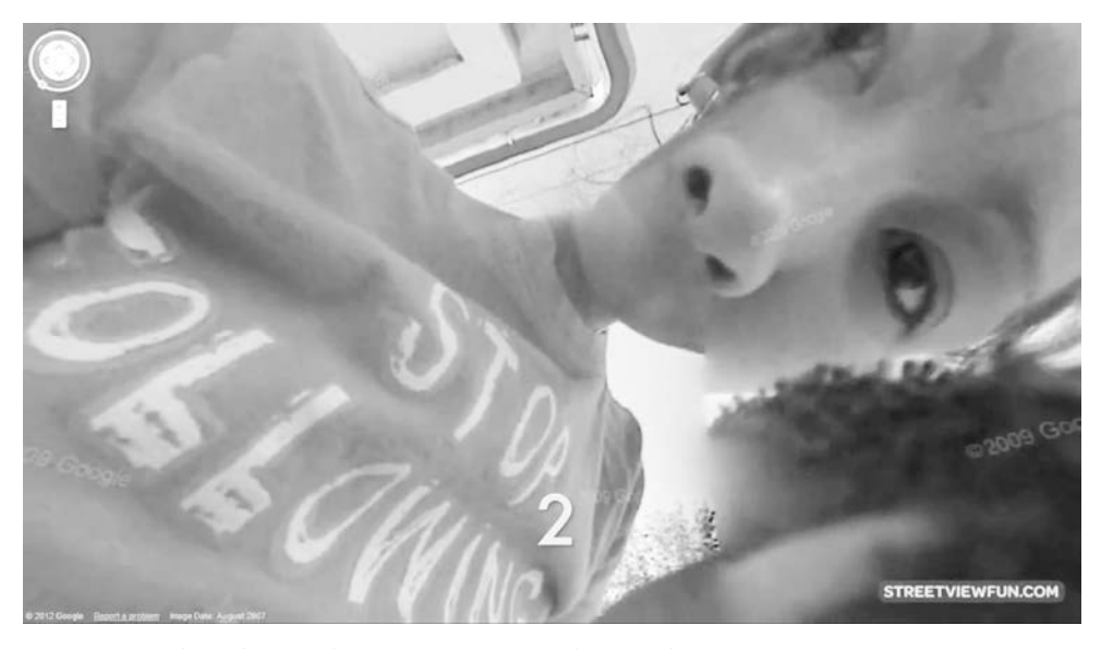
Fig. 5: Screenshot of a Google Street View driver cleaning the camera, 2017

rare to meet them, because they are behind the lense for confidential reason. But insects allow to encounter some of them.