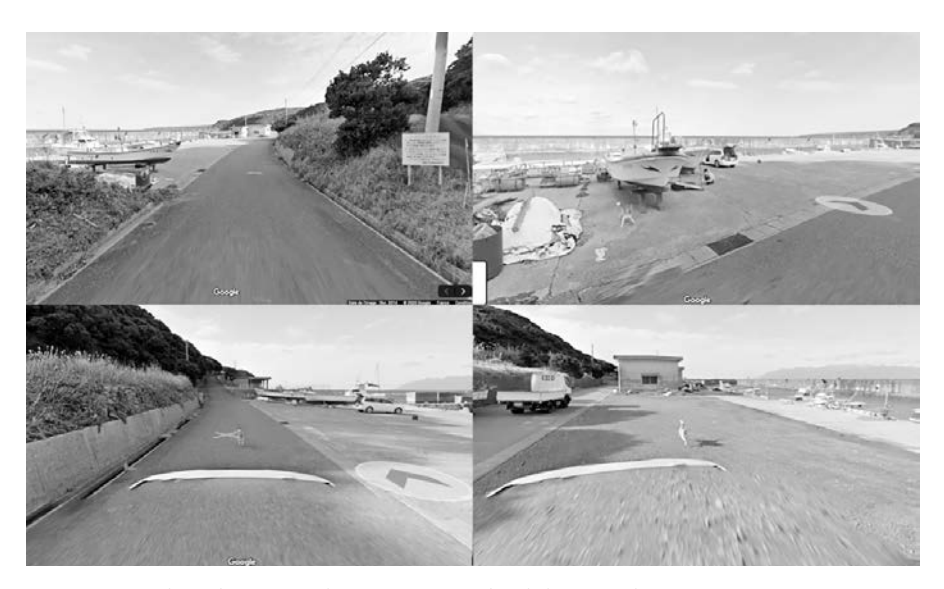
Fig. 2: Screenshots from Google Street View of a Shiba Inu Chasing a Car in Japan, 2014

There are many revenge stories of animals fighting back undesired machines in their surrounding that circulate on the internet. Images of a Shiba Inu chasing a Google Street View Car in Japan, district of Kumage, in Kagoshima Prefecture, went viral in April 2018. In this sequence from Google Street View, we first see the pup beside his owner repairing a boat, then attacking and pursuing joyously the unwelcomed visitor until the car reaches a dead-end. There is an intruder in his territory, he won't let that go unoticed. Wether it is a game or a defensive act, the dog's reactions signal the passage of the car, and the act of recording. It also reveals his Umwelt , his own territory shared with his human that »he has« to defend.