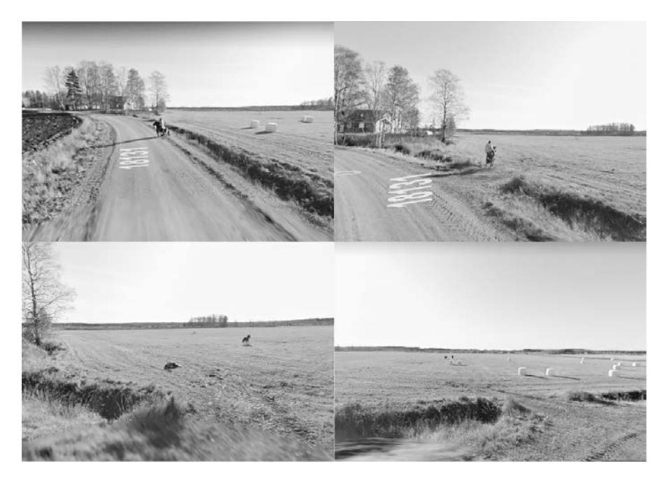
Fig. 1: Screenshots of the sequence of the encounter between a horse and a Google Street View car in Finland, 2009

vehicle at the edge of the field, thus assuming assistance to the unhorsed rider by the driver before he hit the road again. Between that, there are missing shots. Something important took place and we only see the ends of it. What happens in these missing images is a stop, a breach, in the protocol of recording. The event bursts and diverts the spectator from his hypnotic navigation through images, but above all, it diverts the protagonists from their initial situation: the horse from its supposed serenity, the rider from his accustomed ballad, the driver from his programmed mission.