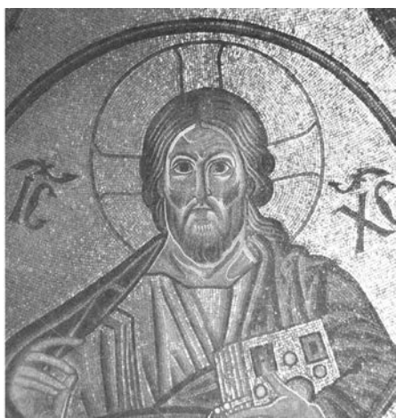
Fig. 2: Still (detail) from Incoming . © Richard Mosse / Christ-Medaillon, Hosios Loukas (Plate II from: Ernst Diez and Otto Demus: Byzantine Mosaics in Greece: Hosios Lucas and Daphni, Cambridge, MA 1931, p. 32)<sup>9</sup>

schematic facial forms, mere traces of biological life that may exhibit a marbled patina of warmer and cooler zones but mostly remain flat and graphic, with disturbing black eye-sockets. In general, the images offer minute and sharply contoured details, textile structure, rough stone, polished metal, and at the same time, they border on simulation or abstraction. And finally, the excessive distances between lens and object tend to compress the represented space. It loses its regular dimensionality and depth, showing many of the coastlines, tent cities or landscapes in a peculiar fusion of top and frontal view – similar almost to the urban panoramas of pre–Renaissance copperplate engravings.<sup>10</sup>