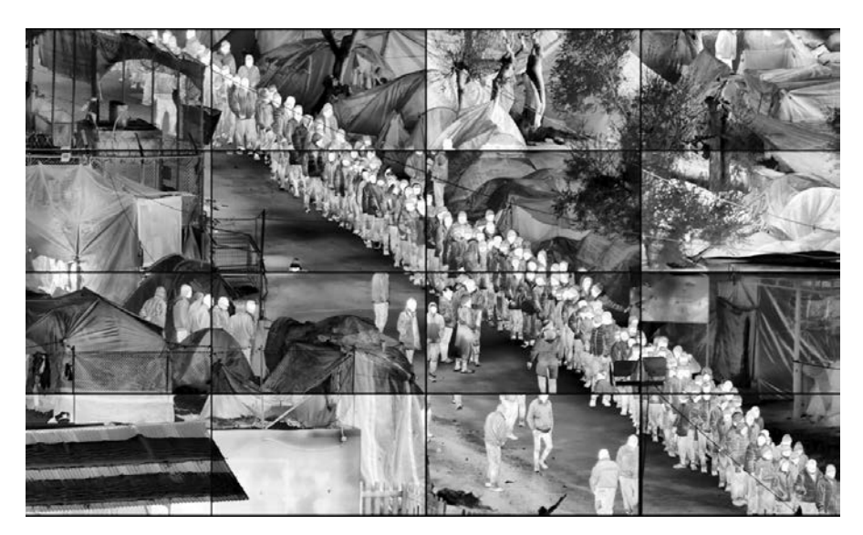
Fig. 4: Still from Richard Mosse: Grid (Moria) (16-channel flatscreen installation, 2017). © Richard Mosse

On the one hand, such a simulation of visual continuity does not conform with classical Byzantine iconography. Otto Demus's time-honored survey of monumental church mosaics declares that their separately framed images "are not links in a continuous chain of narrative" and "must not flow into one another". On the other, Mosse's Heat Maps — and even more so his Grid (Moria) — seem to reactivate the "almost indiscriminate covering of the walls with mosaic pictures which is found in [...] Venice and other colonial outposts of Byzantine art". in one of San Marco's cupolas the panels and figures "appear as a continuous sequence without completely destroying the separate identities of the single scenes. Elements of setting are economically used for this purpose; where they were not sufficient, a simple line in the golden ground indicates the separation of two scenes. [...] The little figures are still closely packed together; indeed, the whole looks like a close procession rather than a series of scenes following each other in time".