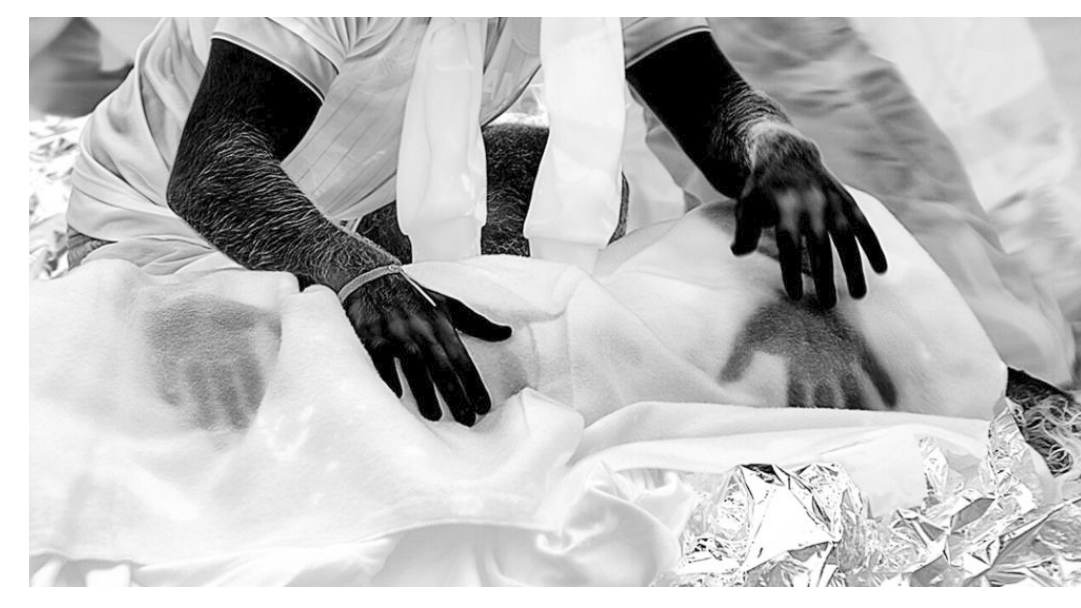
Fig. 1: Still from Incoming (HD video, 2017). © Richard Mosse

to anthracite and leaden black, as the apparatus is entirely color-blind (and therefore also indifferent to the color of human skin). Although providing nothing but a map of relative temperature differences, they sometimes appear like photographic negatives when Mosse changes his camera's mode of operation from white hot (and black cold) to black hot (and white cold). Since in digital thermal imaging the assignment of a unique color or shade to the value of each temperature data point is completely arbitrary, reversing the palette's usual polarity will present warm objects like human bodies was black signatures on a nearly white background. This is why Mosse's pictures do not present any portraits — only de-subjectivized,